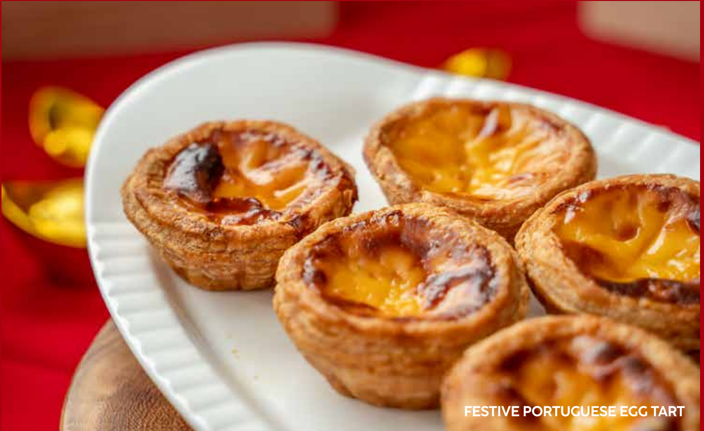
FESTIVE PORTUGUESE EGG TART