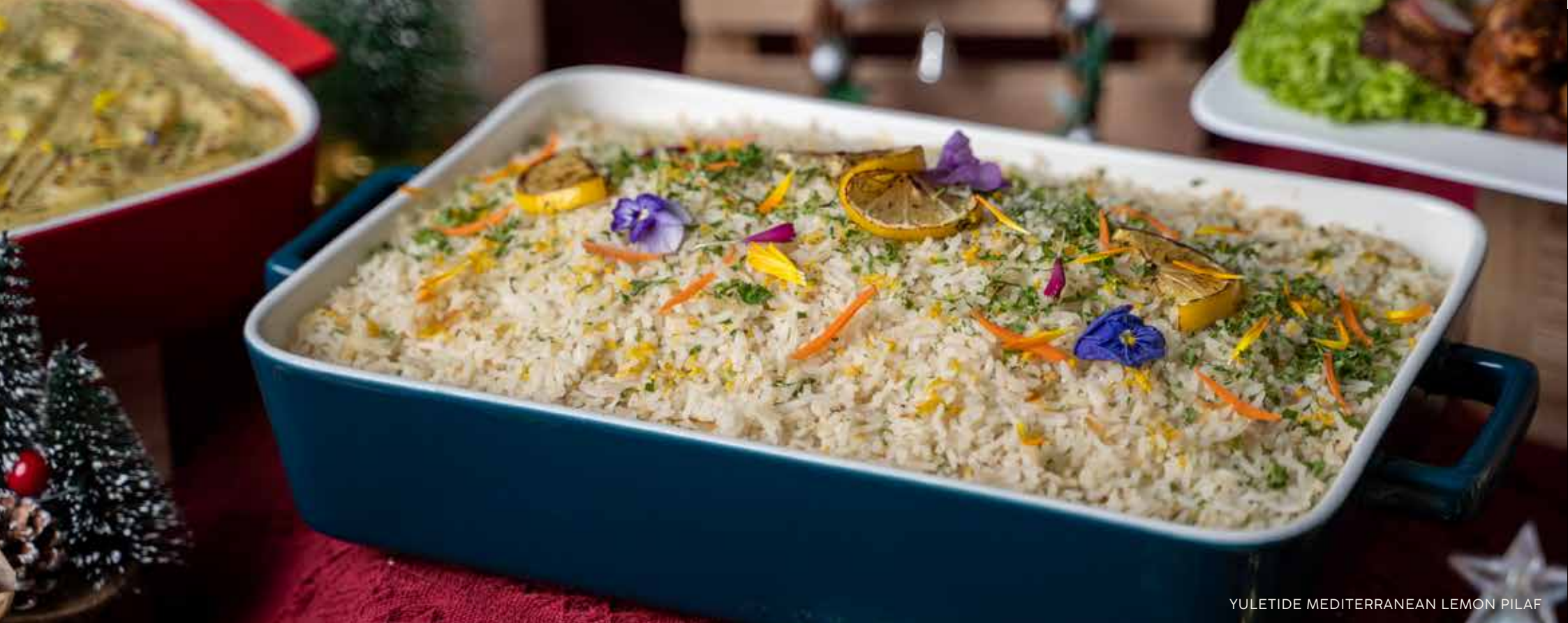
YULETIDE MEDITERRANEAN LEMON PILAF