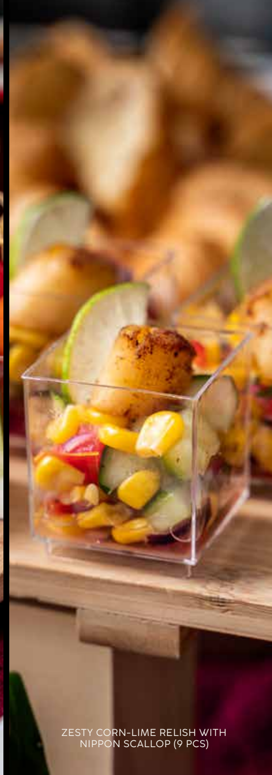
ZESTY CORN-LIME RELISH WITH NIPPON SCALLOP (9 PCS)