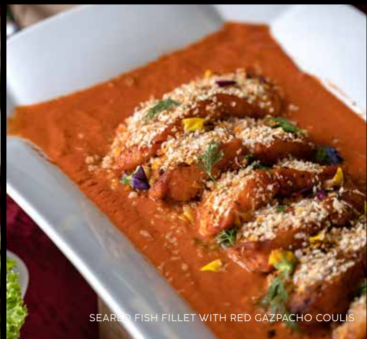
SEARED FISH FILLET WITH RED GAZPACHO COULIS