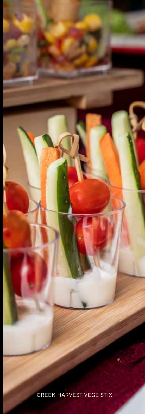
GREEK HARVEST VEGE STIX