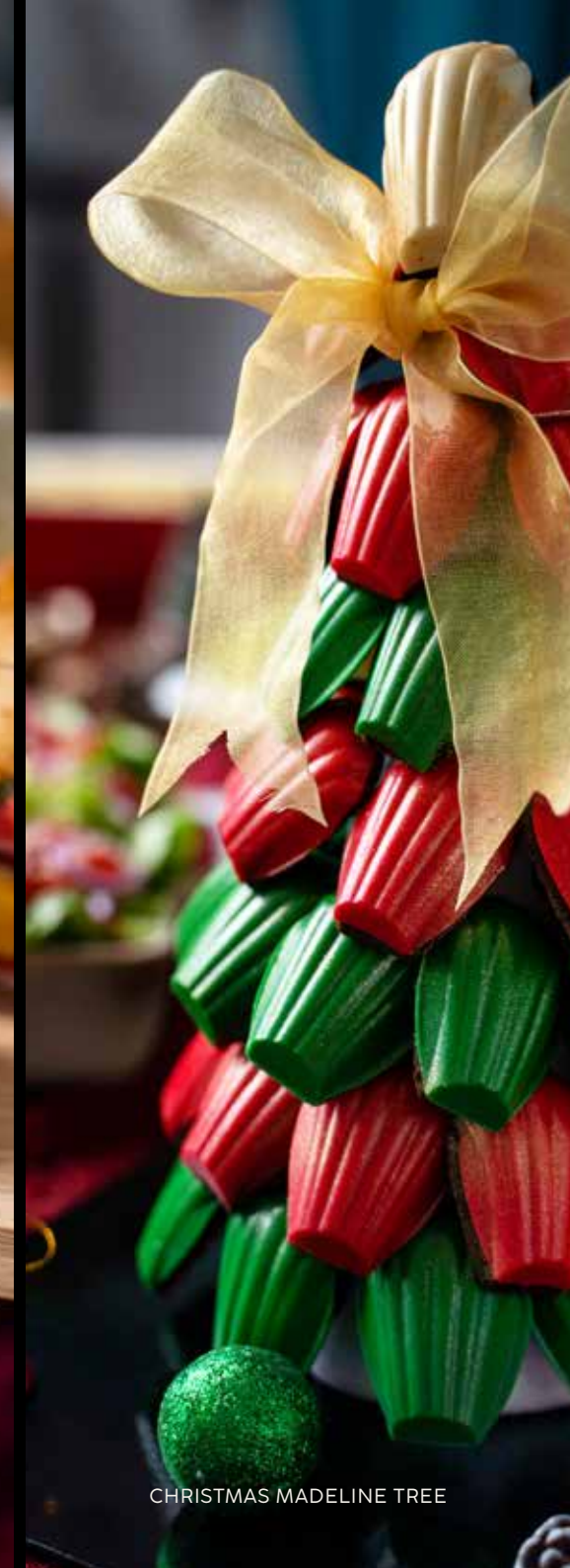
CHRISTMAS MADELINE TREE