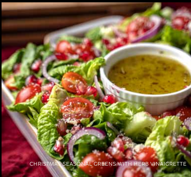
CHRISTMAS SEASONAL GREENS WITH HERB VINAIGRETTE