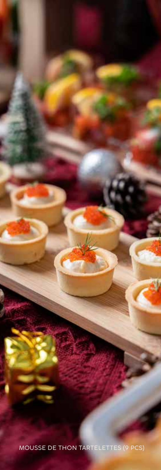
MOUSSE DE THON TARTELETTES (9 PCS)