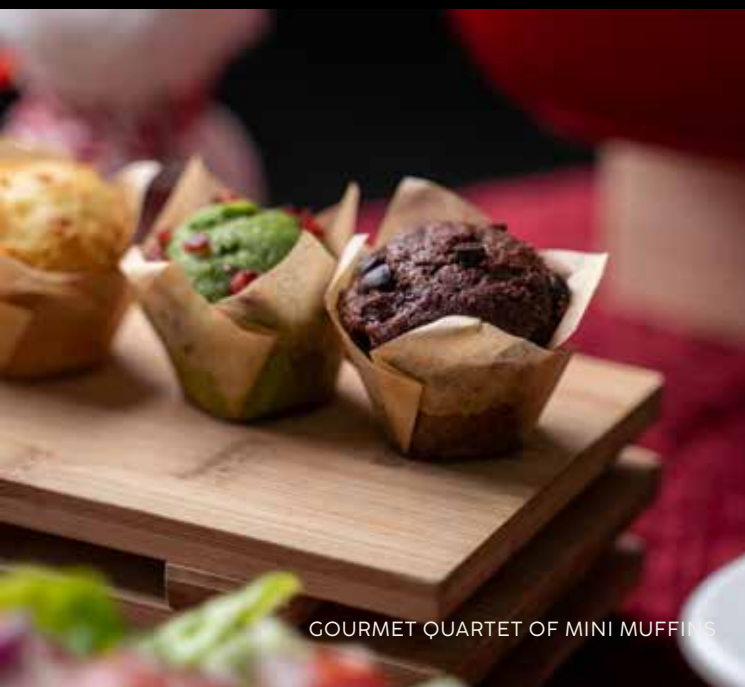
GOURMET QUARTET OF MINI MUFFINS