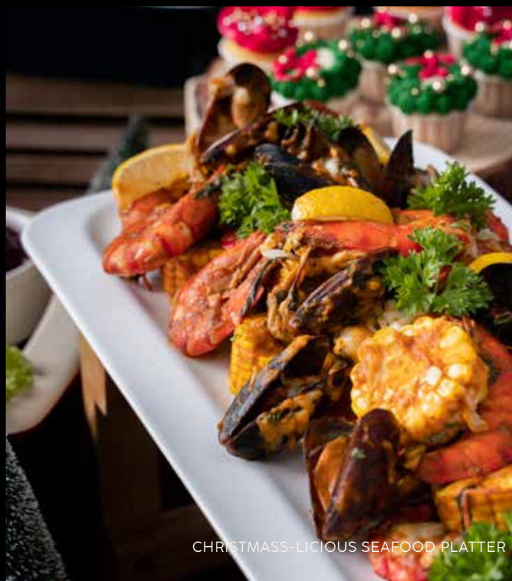
CHRISTMASS-LICIOUS SEAFOOD PLATTER