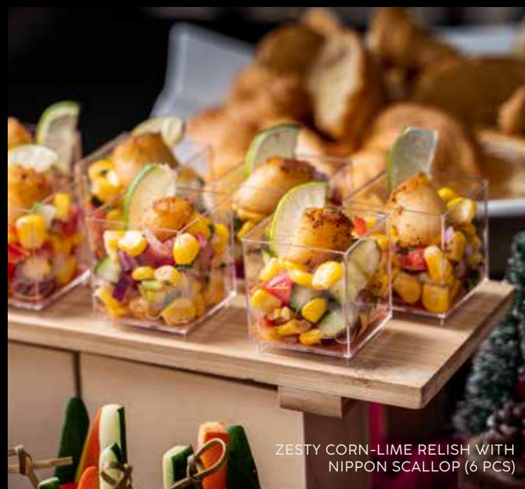
ZESTY CORN-LIME RELISH WITH NIPPON SCALLOP (6 PCS)