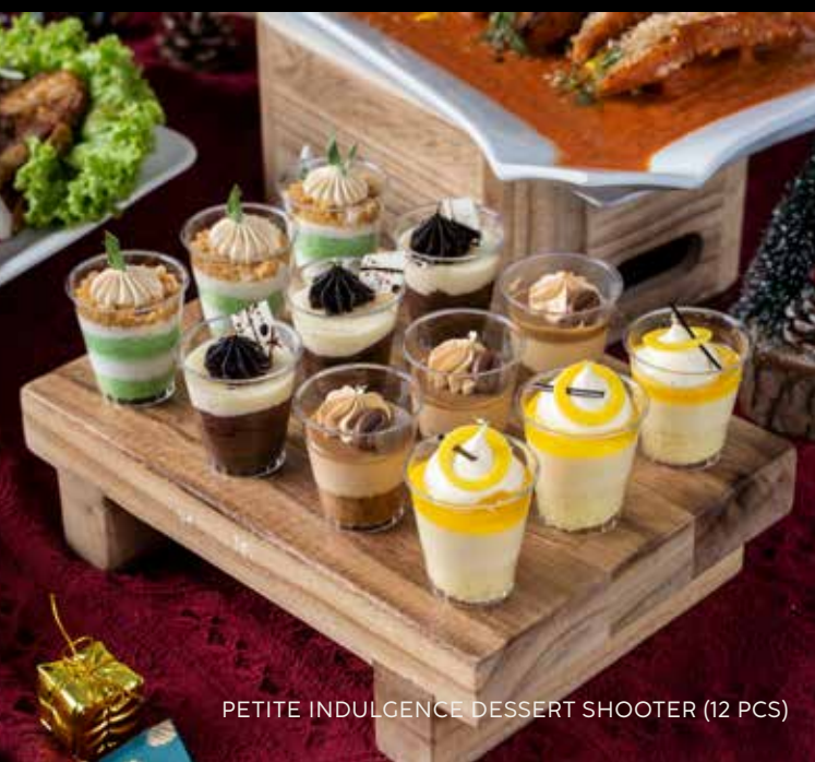
PETITE INDULGENCE DESSERT SHOOTER (12 PCS)