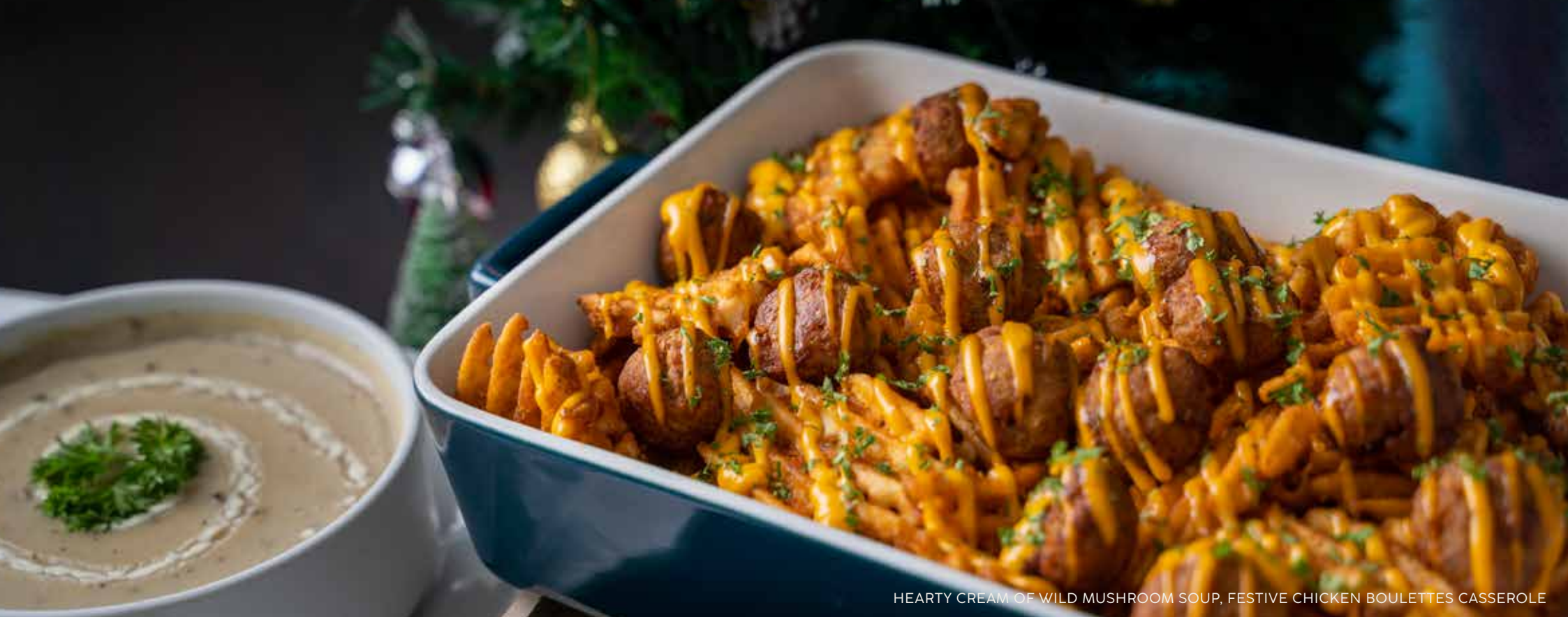
HEARTY CREAM OF WILD MUSHROOM SOUP, FESTIVE CHICKEN BOULETTES CASSEROLE