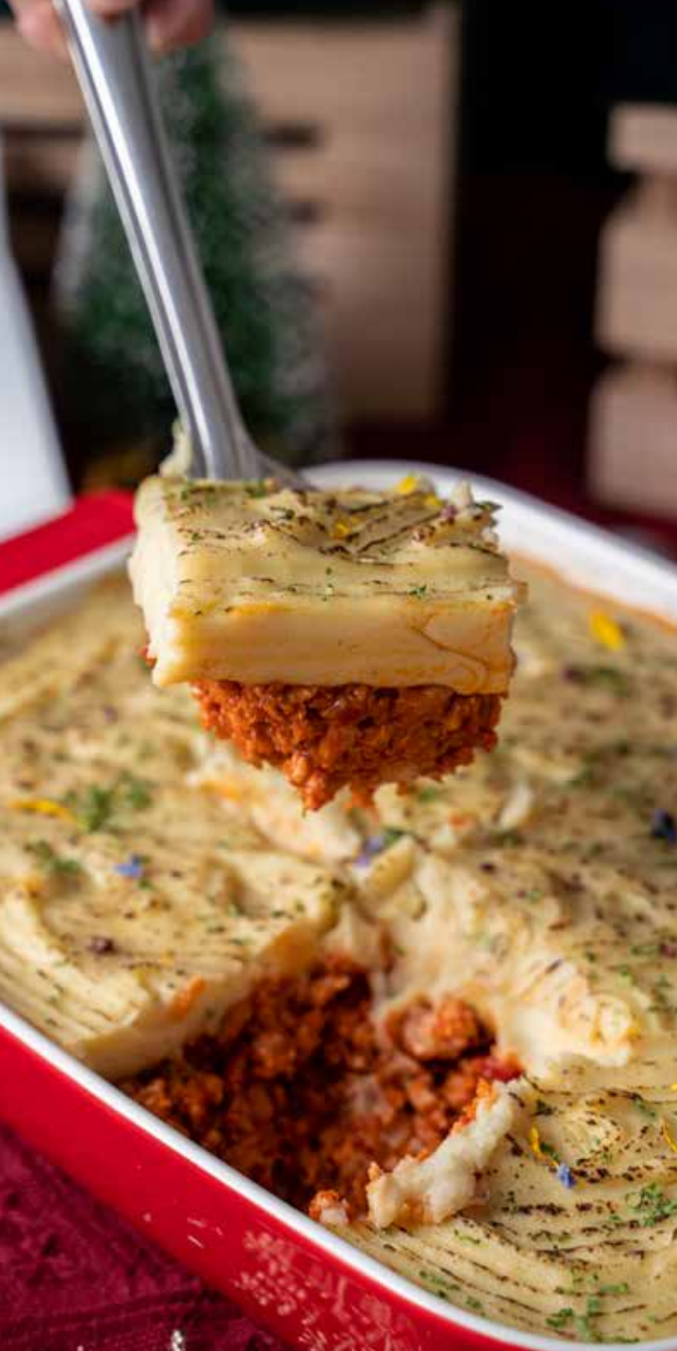
GRANNY'S HOUSEMADE COTTAGE CHICKEN PIE