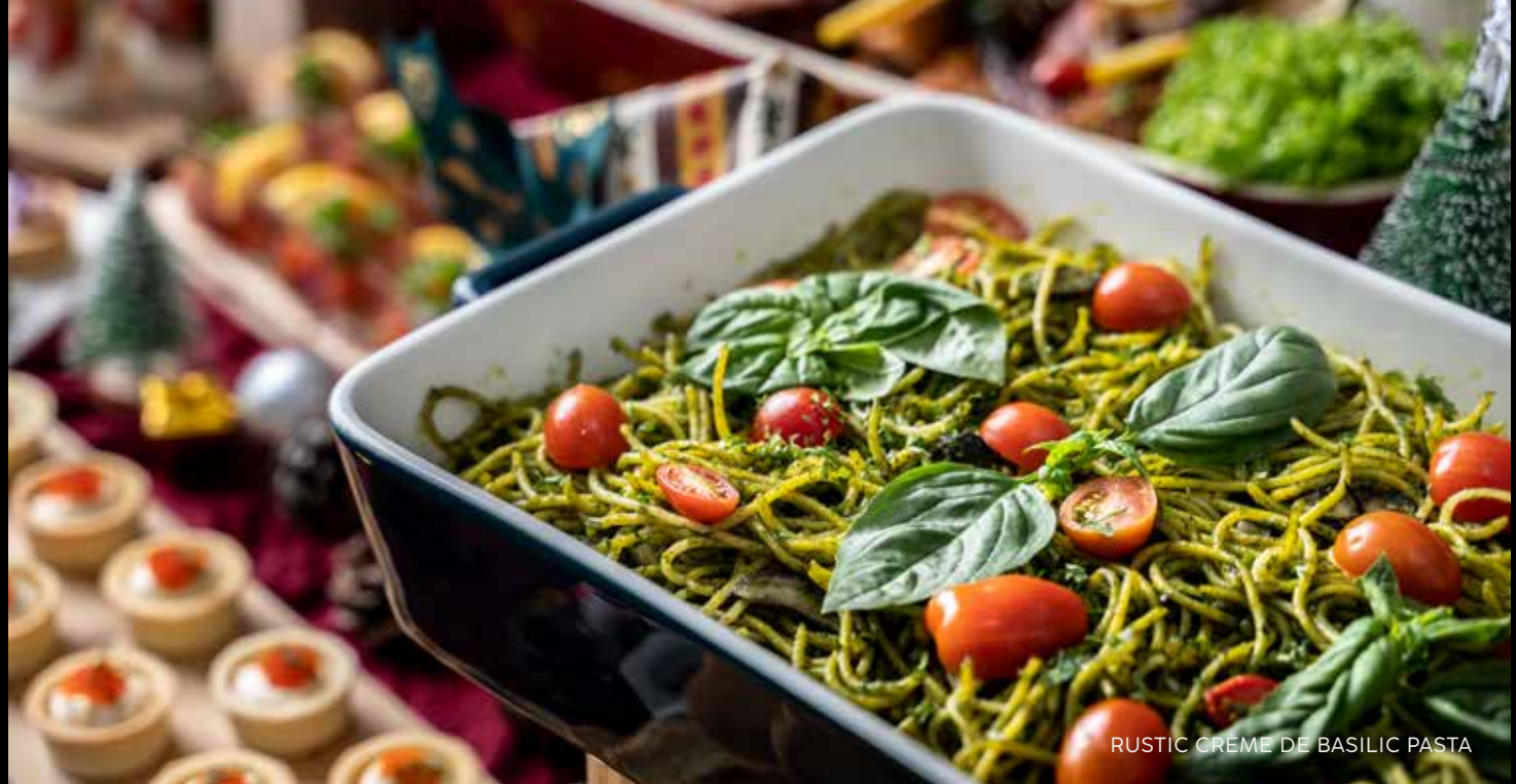
RUSTIC CRÈME DE BASILIC PASTA