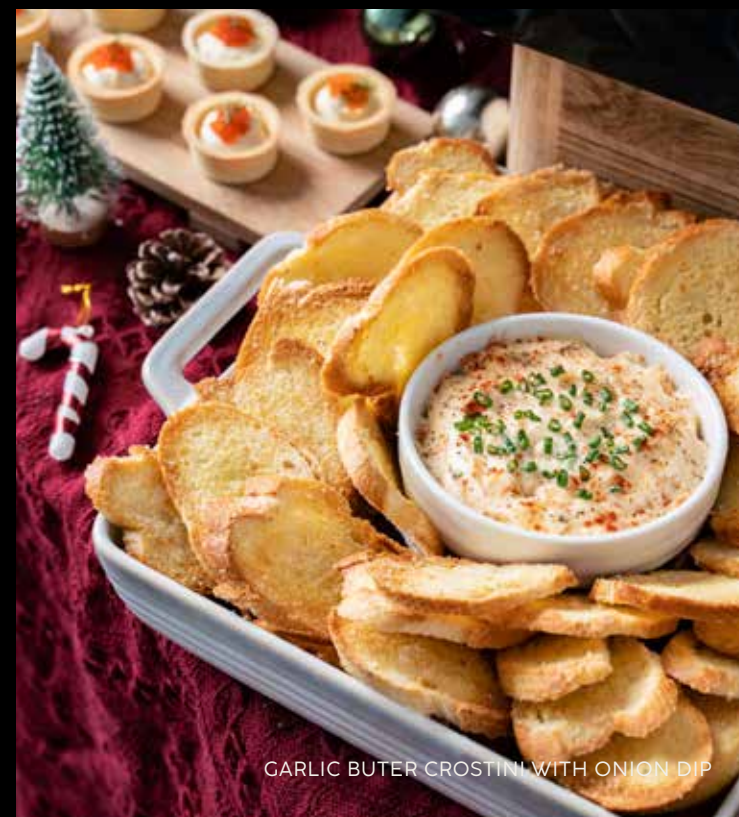
CARLIC BUTER CROSTINI WITH ONION DIP