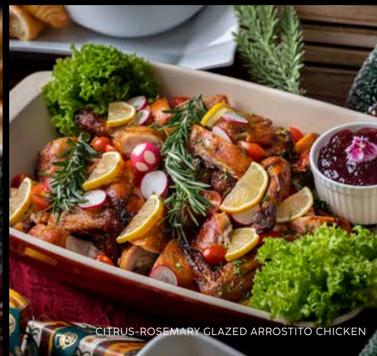
CITRUS-ROSEMARY GLAZED ARROSTITO CHICKEN